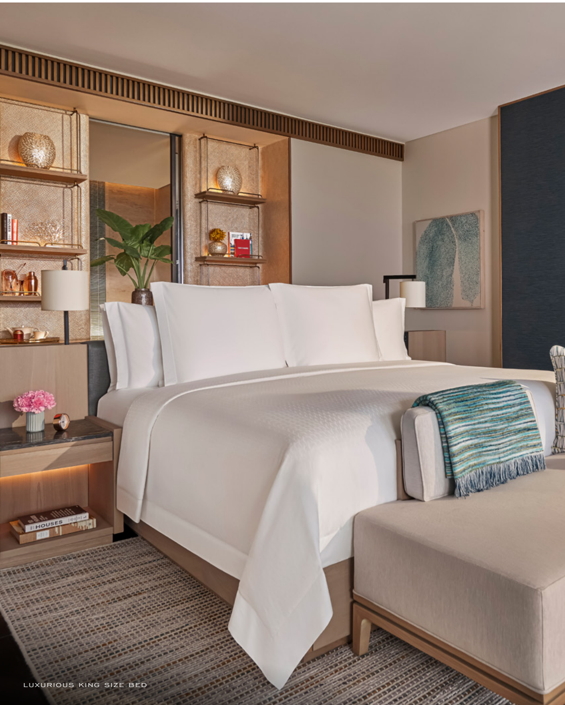
LUXURIOUS KING SIZE BED