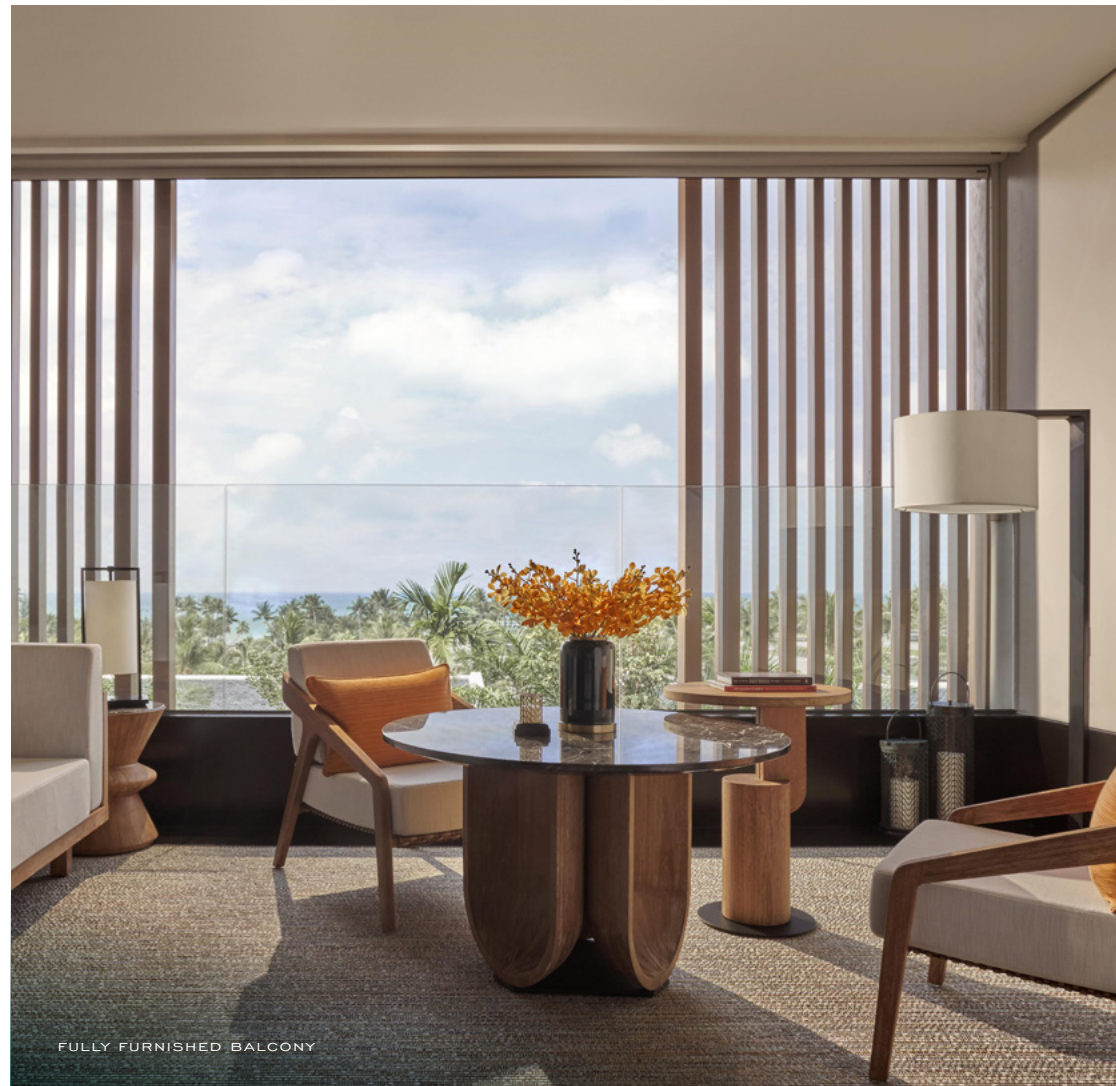
FULLY FURNISHED BALCONY