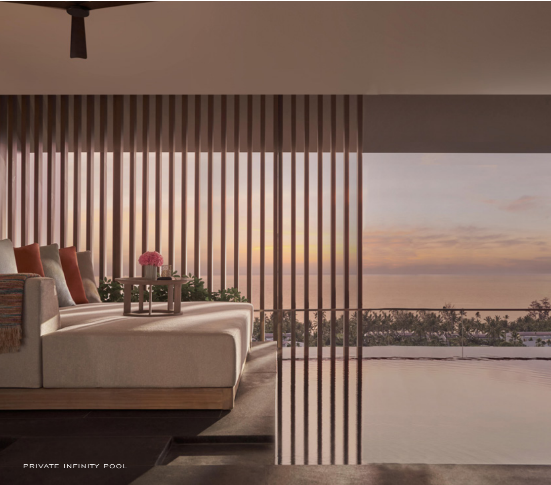
PRIVATE INFINITY POOL