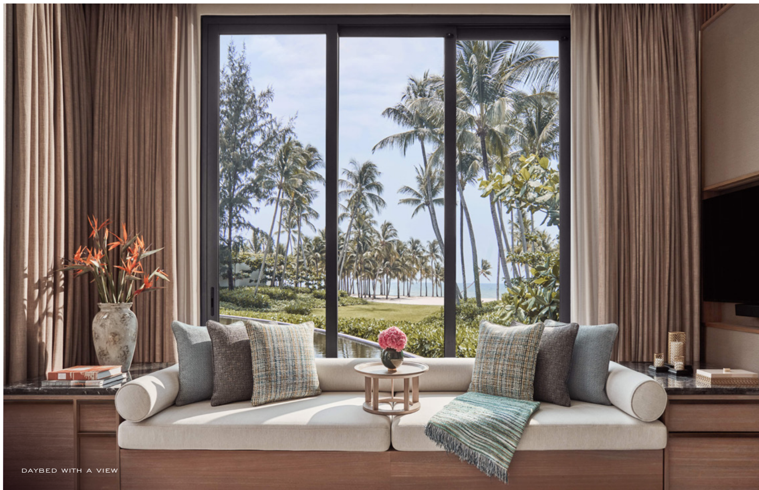
DAYBED WITH A VIEW