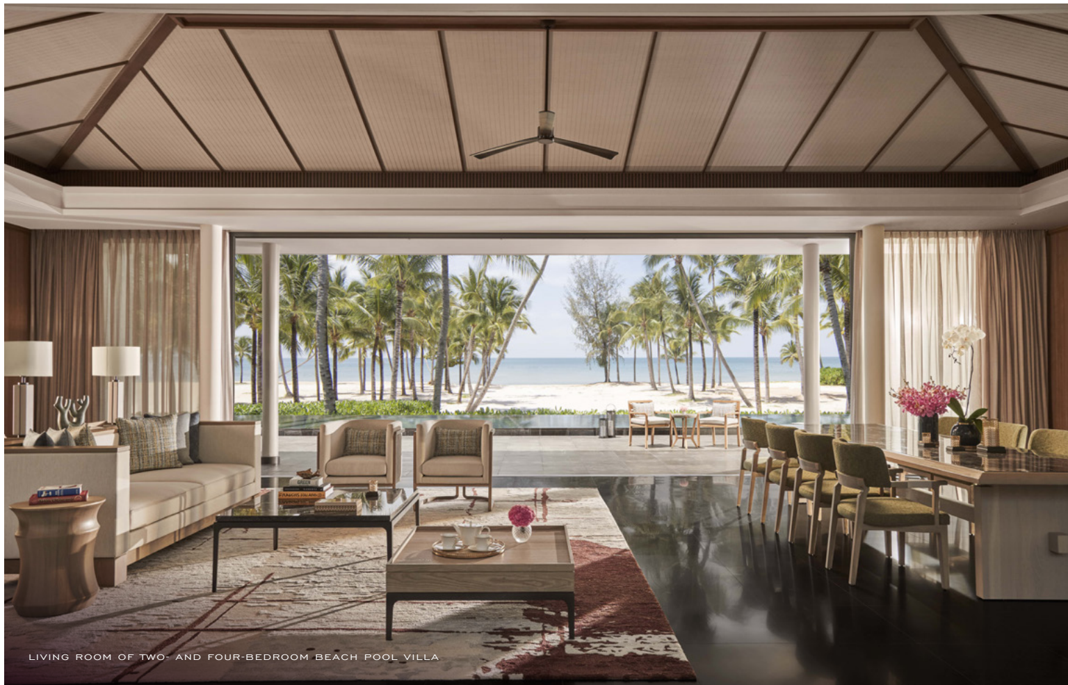
LIVING ROOM OF TWO- AND FOUR-BEDROOM BEACH POOL VILLA